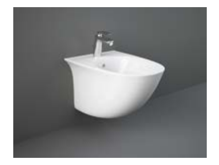
52 CM SENBD21019WHA Hidden Fixations