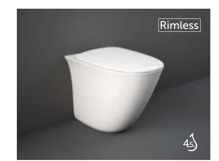
52 CM SENWC13469WHA