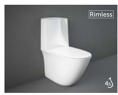
62 CM SENWC11469WHA SENWT18009WHA