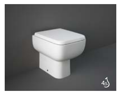
50 CM 55169WHA